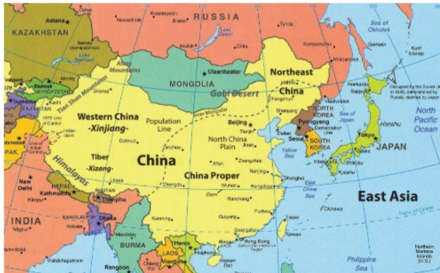
Figure 10.1 East Asia and Its Neighbors

China is the largest country in East Asia in both physical size and population. Other countries of East Asia include Mongolia, North Korea, South Korea, and Japan. Hong Kong, Macau, and Taiwan are associated with mainland China.