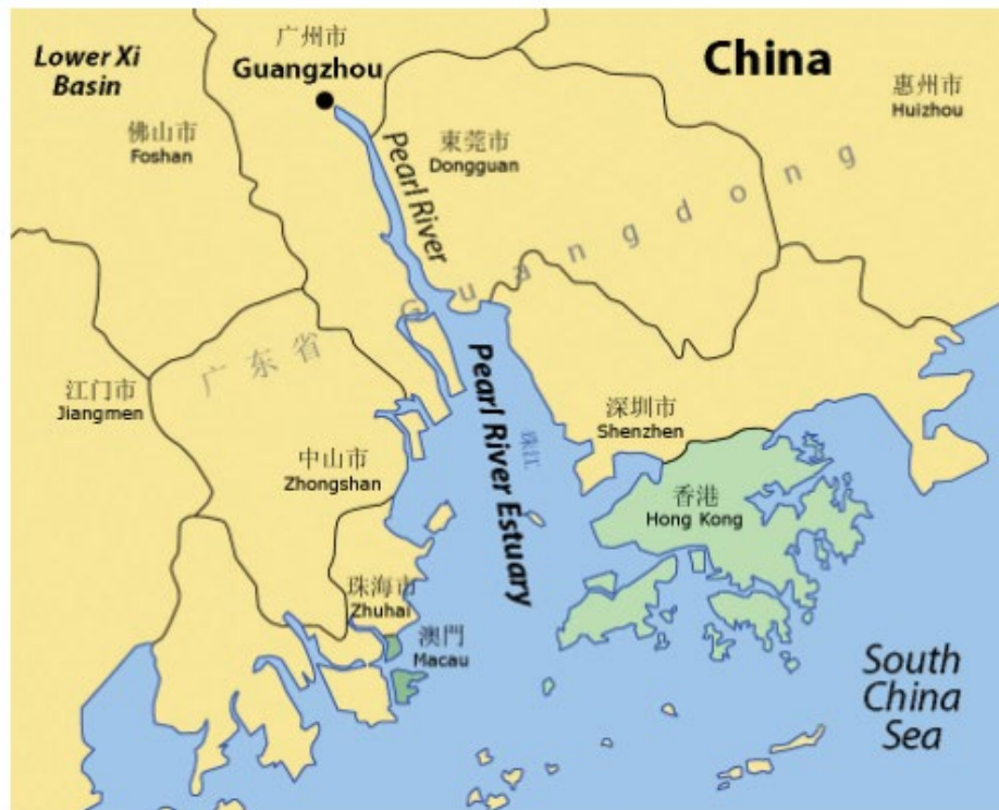
Figure 10.5 Xi-Pearl River System

An estuary is a wide area at the mouth of a river where it meets the sea. Hong Kong is located on the eastern side of the Pearl River Estuary, and the former Portuguese colony of Macau is located on the western side of the waterway.