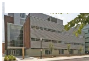
Scott Laboratory Use the main entrance at 201 W. 19 th Ave. (pictured here)

Smith Laboratory 174 W. 18 th Ave. Columbus, OH 43210